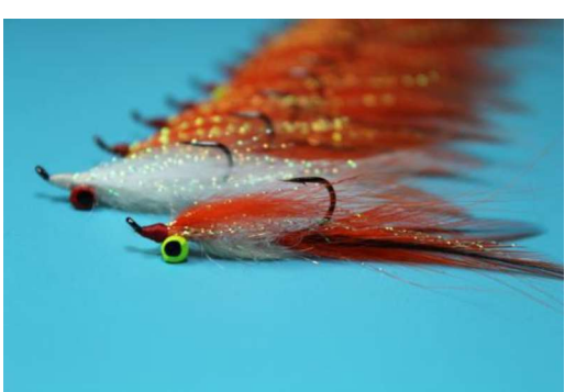
Split Tail Clouser

You may substitute Finn Raccoon for the Arctic Fox wing as well.