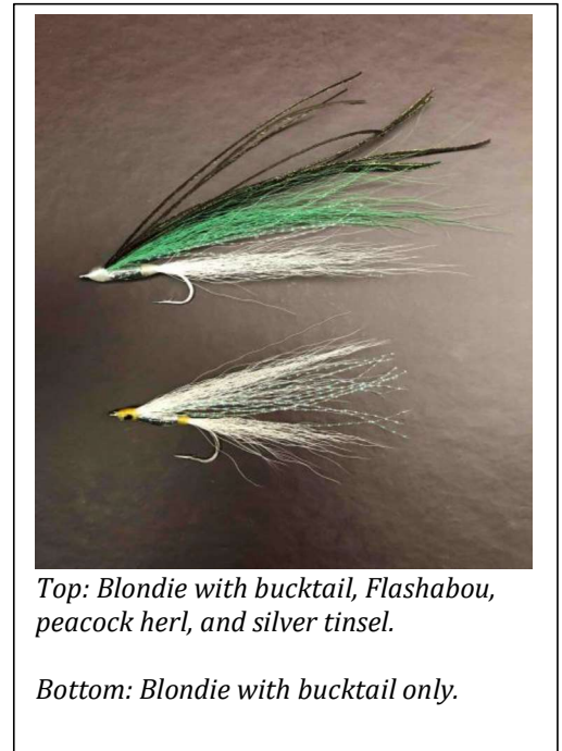
Top: Blondie with bucktail, Flashabou, peacock herl, and silver tinsel.