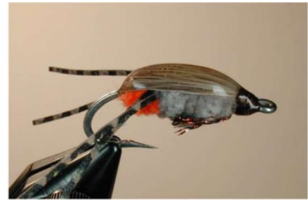
Smitty's Sand Flea