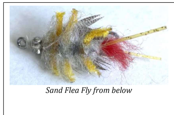
Sand Flea Fly from below