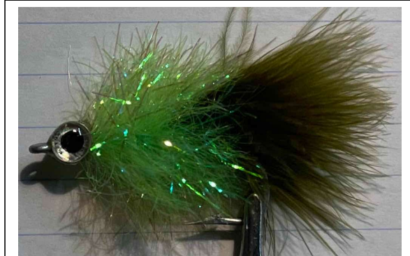
Bill Scarola's Jumping Jack Flash, fly of the month for the September outing in Safety Harbor. It's a winner in saltwater and in freshwater.

Zoom either. Bruce is recovering from you-know-what. We'll get back together again to tie flies one of these days.