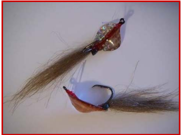
FLA Spoon Fly: Text, photo and drawings by Bob Burns