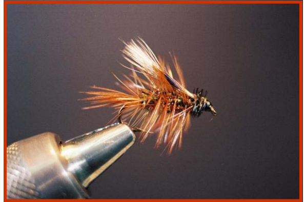
Picket Pin; Tied and photographed by Charlie Most

Step 5. The head is a single peacock herl wrapped over the squirrel tail butts. Be sure to break off a half inch of a single herl, tie it in and wrap forward to just behind the eye. Whip finish and the fly is done.