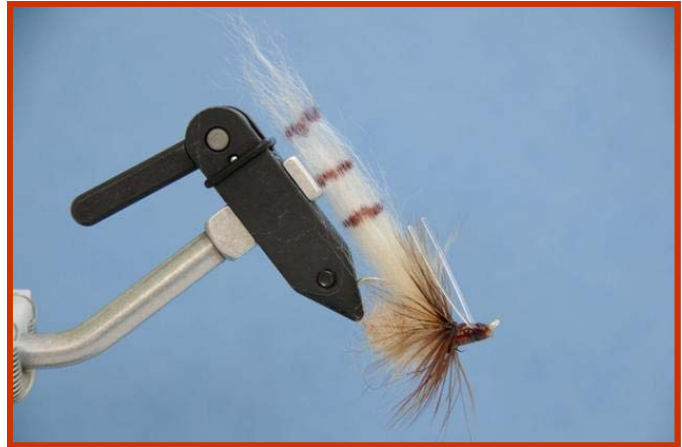
Butterfly: tied and photographed by Al Pitcher