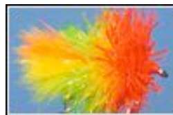
Blob fly. Image and tying instructions courtesy of at Diptera.co.uk