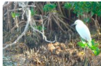
This snowy egret was ready to chow down, too, but, as it was with the fly-fishers, catching was a tad slow.