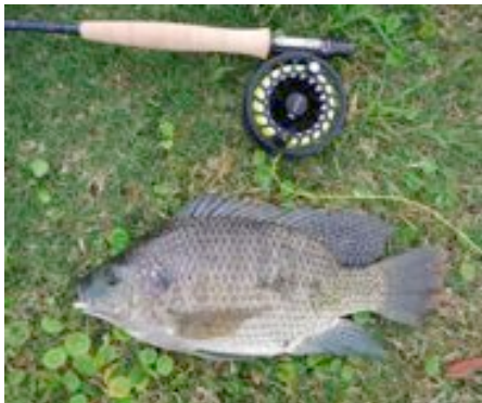
Andy's blob fly tilapia from a neighborhood pond

Back in the states, Andy caught a five-pound bass (alas, no photo), a ¾-lb tilapia caught on a blob fly in a l large pond, and a turtle. Yes, a turtle.