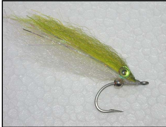
Pat's Bead Butt Baitfish Fly tied and photo by Pat Damico

Capt. Pat Damico's BBBF is a fly he developed some time ago and has proven to be a very effective baitfish pattern that is easy to tie, cast and fish. It is constructed with a few modern synthetic materials, that are available wherever fly tying products are sold. This basically is a "high-tie" pattern using weight in the form of a bead located in an unusual position, the butt – hence the name Bead Butt. You're in for a treat with this installment of the "Tying Bench", you'll actually be able to see Pat tie this fly (and several others) by going to a very