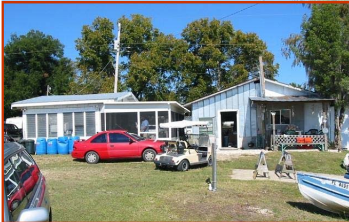
Lake Pasadena Headquarters