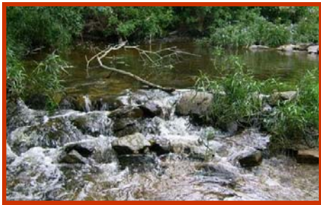
This is the riffle coming under the RR bridge. It's really a nice little bit of nature, tucked away from the rest of the world.....tk

I first got started on Alligator Creek when I caught a bass just down stream at a RR bridge. The RR had used a lot of ballast to build the bridge and created a small pool on the upstream side. I figured I'd catch a bream but was surprised to see it was a small bass.