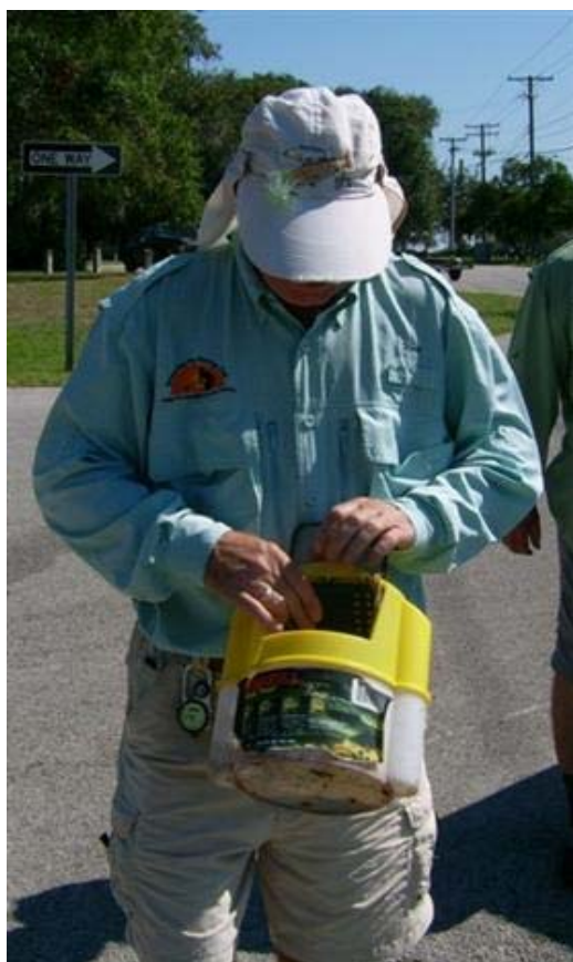
Secret weapon? Some guys will try anything to get the trophy!