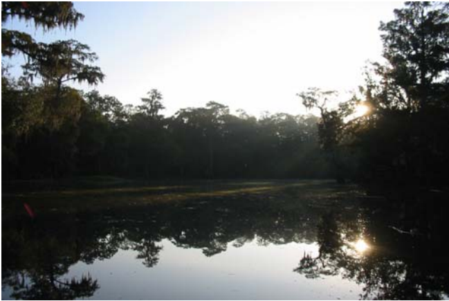
8:00 a.m. on the Hillsborough River at Trout Creek