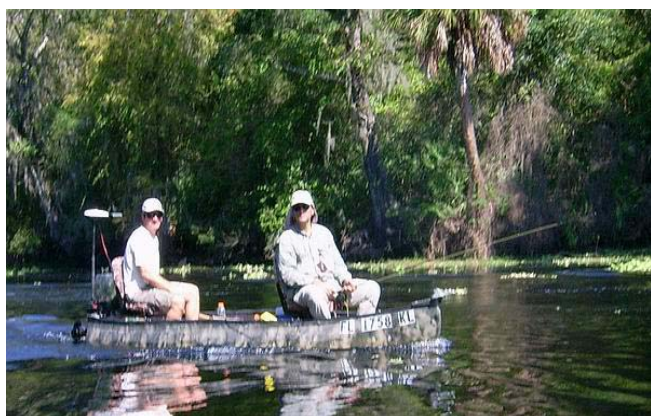
Tampa Club members also on the move.