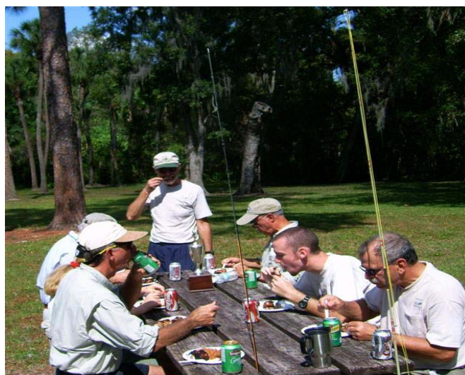
Even our Outing Chairman gets to enjoy the barbecued chicken