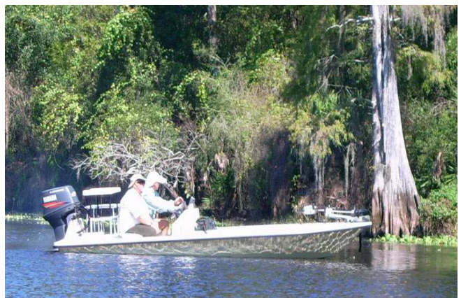
A couple more Tampa Club members