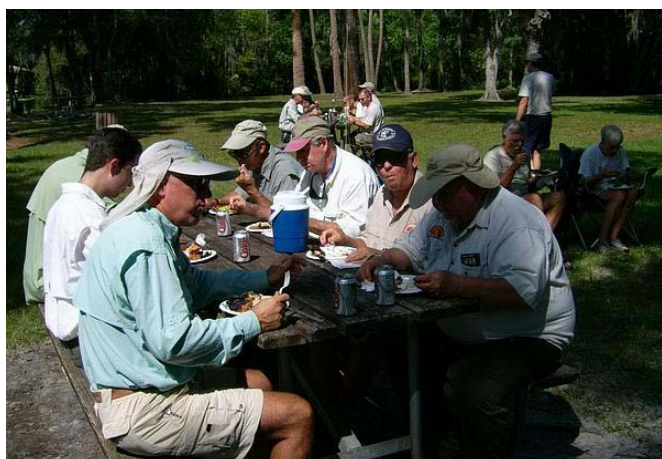
The food was a little late arriving, but we were told it was worth the wait.