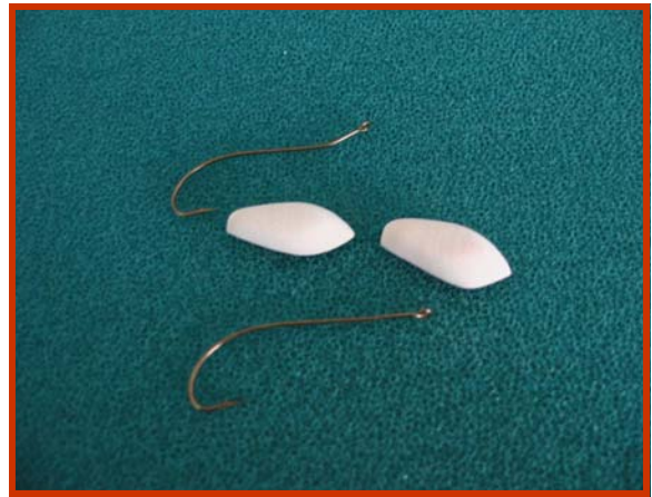
Central Draught hook before and after straightening with foam body halves.

Nothing in the Mustad catalog seemed right but then I noticed what they call a “central draught” hook which is close to what I was looking for except for a “bent back” kink a quarter shank or so back from the eye. The size designation is also different with a size 24 correlating with a regular 1/0 hook, etc. Since that kink could be straight-