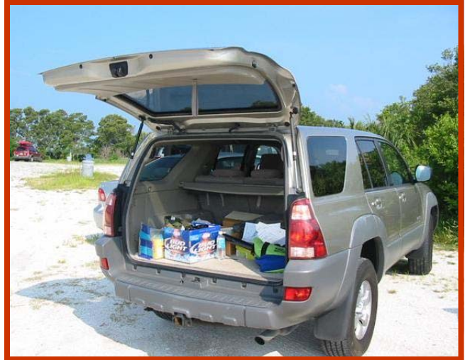
Aug. 11th was a hot day but looking into the back of Pat's truck, we can see how he and Enver kept their cool.