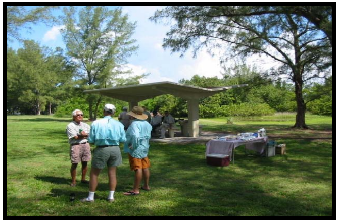
Fishermen doing what fishermen do, swapping lies