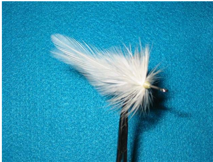
D.T. SPECIAL tied by Paul Sequira

Take the third pair of neck hackles, remove a bit of the fuzz from the base of the feathers and tie in by the butts in front of the tie-in point of the tail. Now palmer these forward with three to four wraps.