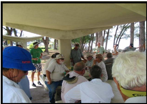
Recalling memories of Don