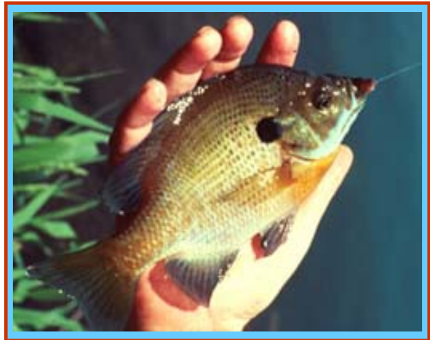
Lake Pasadena? Maybe, if you're lucky!