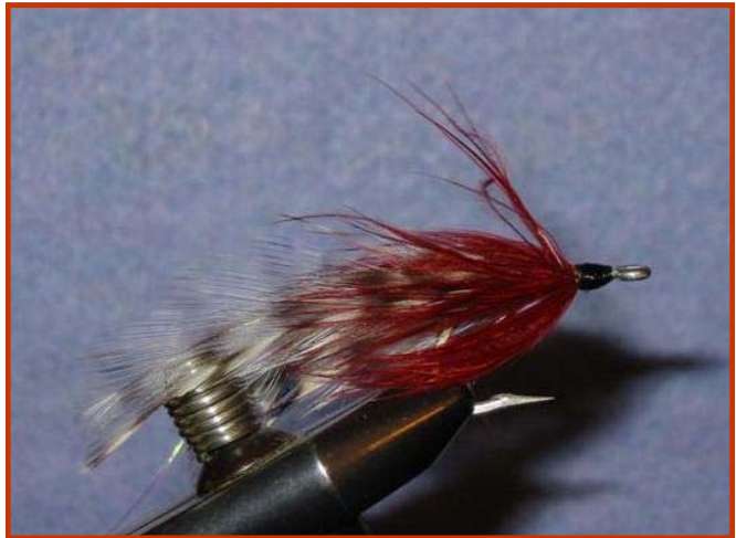
Inshore Keys Tarpon Fly, tied and photo - Paul Sequira