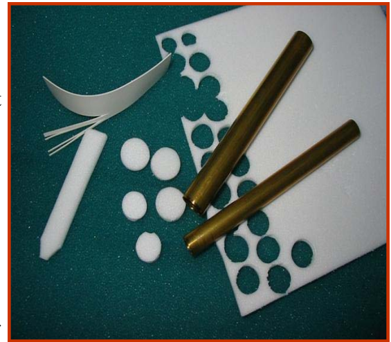
Sharpened tubing required for cutting Spider bodies, closed cell foam and rubber leg material.

Getting set up for tying these flies the first time is the worse part of it. You need a special tool that isn't sold in the fly shops to cut out the Spider bodies; but don't worry, it is simple to make. Many tiers simply take an empty 45 caliber cartridge case and sharpen the inside of the cartridge by running a utility knife blade at an angle to the edge. Brass tubing of various diameters can also be used; you can buy this tubing in any hobby shop. Ken Doty has the best one I've seen; a piece of metal golf club shaft cut to the proper length gives him two sizes, one small and one large. Actually, any hollow tube of the appropriate size will do; whatever you chose, sharpen it as described above. Use your sharpened tube to cut out some spider bodies by placing the foam on a solid surface and pressing the tube while twisting it through the foam. Pop the cut out spider body out of the tube. Do a bunch of them and you've got a good supply for many spiders. There are many ways to tie these flies, below is my method. Let's get to it.