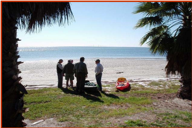
Yep, that's where we got 'em.