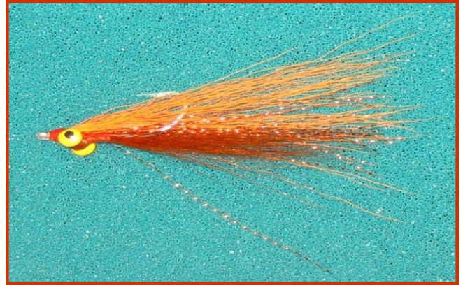
Orange & Brown Clouser Deep Minnow

Note: When fishing with sink tip or intermediate lines as described in Capt. Pat’s excellent article on the previous page, and depending upon water depth, you can very often get down deep enough using an unweighted fly. A good choice would be an orange & brown bendback (with or without a body wrap) as depicted opposite. Tying procedure was described in the On The Fly, Fly Tying Bench, Dec. 2006, Carl’s Glass Minnow.