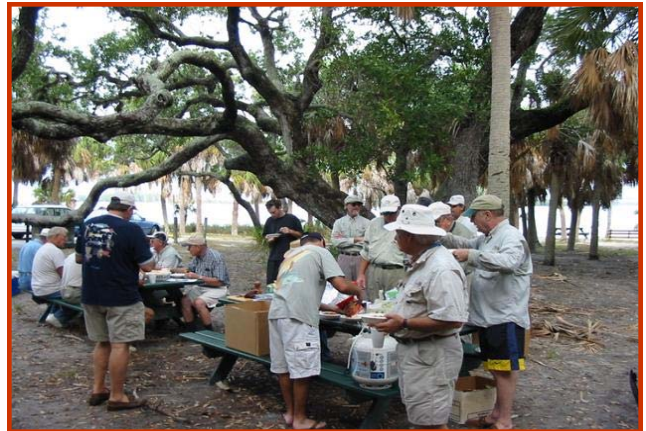
Everyone went back for seconds on the chili, smoked venison, corn bread and several great deserts.